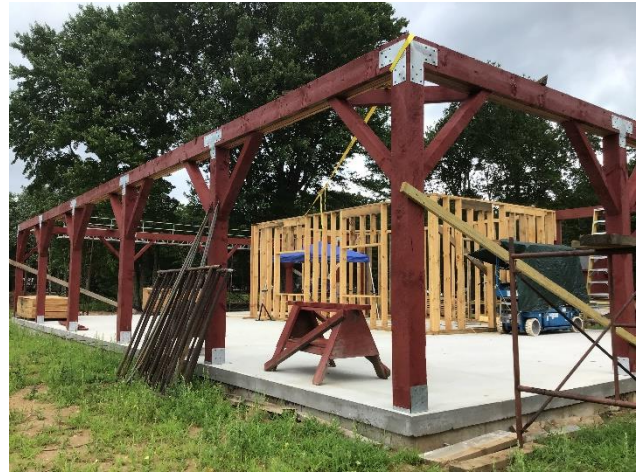
First roof truss.